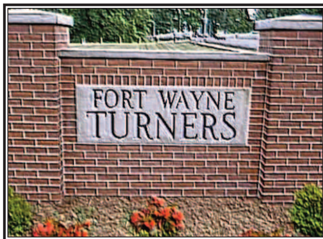
National Golf Tournament at Ft. Wayne