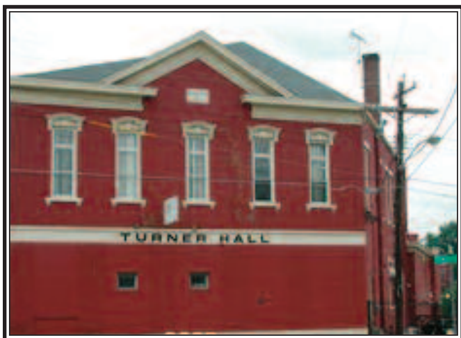
Covington to host National Softball