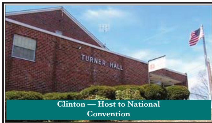
Clinton — Host to National Convention