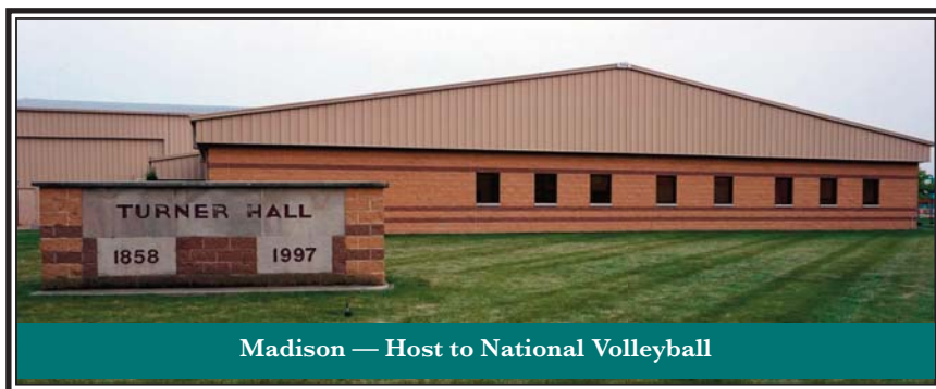
Madison — Host to National Volleyball